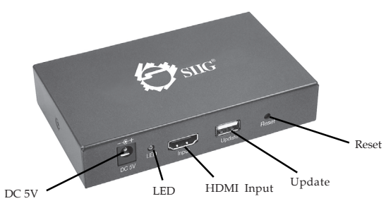
Figure 1 Front Panel